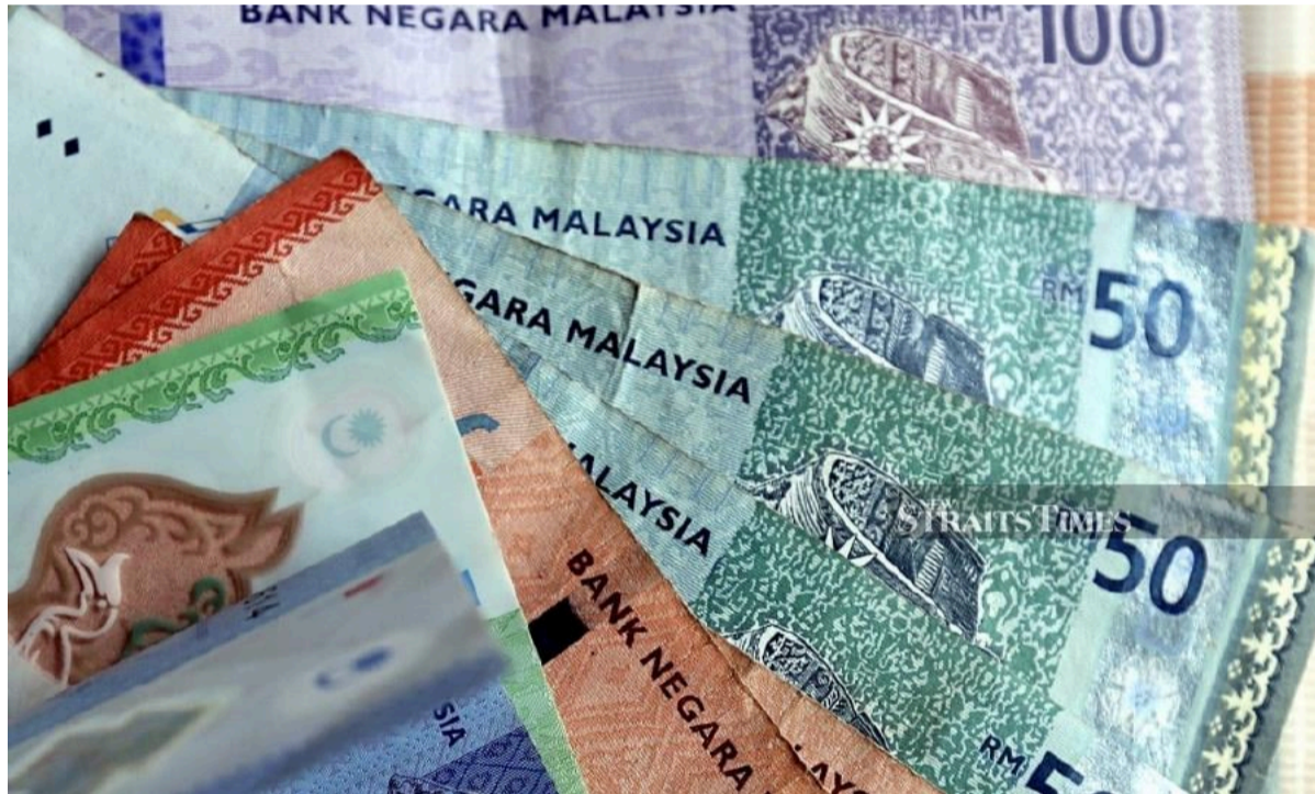
Some Malaysians have suggested that the government impose a time limit for claiming the funds.

Keywords: Government , News , Malaysia , Frustrated , Nst , Anwar Ibrahim , Amir Hamzah , Applicants , Accountant General's Department , Malaysia News , Unclaimed Funds , Unclaimed Money